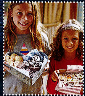
EDIBLE GIFTS FOR KIDS TO MAKE