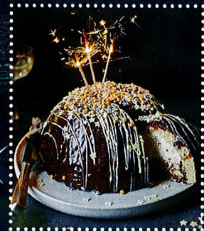
AMAZING PUDS & CAKES