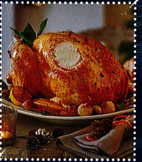
EASY BIG DAY TURKEY MENU